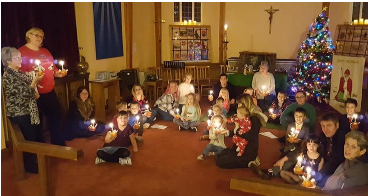
Christmas Eve – Carols round the Crib